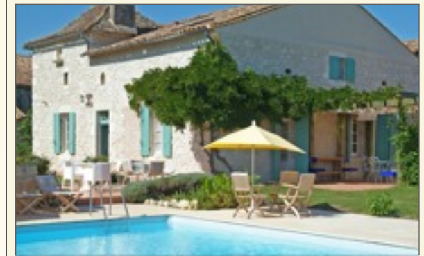
LE PETIT ROUSSET